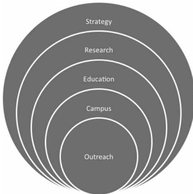
Figure 2: A stacked Venn community model of the sustainable campus with the five areas connected somewhat differently compared to the managerial model), emphasizing overlapping areas of concern and interaction.

Although we find the managerial model (figure 1) inspirational and fundamental we find a need to add to it in our articulation of the sustainable university. The managerial model is, by necessity, hierarchical and while this supplies structure it can lead to compartmentalization. Obviously, we risk different areas of the model only connecting at higher structural levels. Nonetheless, all models build on simplification, placing focus on some dimensions of the phenomenon while ignoring or downplaying others. Switching focus, it is possible to illustrate the five different areas as highly connected through a stacked Venn diagram. We call this the community model as it illustrates interplay between the different areas.